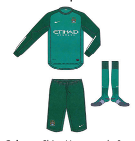
Colours: Shirt: Hyper verde & lucky green (two tone) \ Shorts: lucky green / Socks: Hyper verde