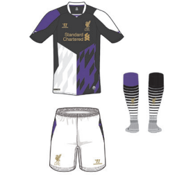
Colours: Shirts: Black, Purple, White / Shorts: White, Purple, Black / Socks: Black, Purple, White