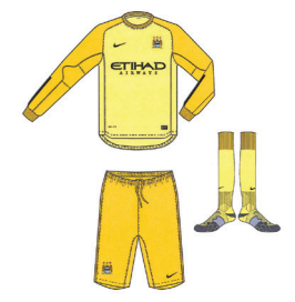
Colours: Shirt: Chrome yellow (two tone) / Lemon frost / Shorts: Chrome yellow / Socks: Lemon frost with chrome yellow trim