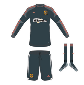
Colours: Shirt: Dark shale, medium lead, red zest / Shorts: Dark shale, red zest / Socks: Dark shale, red zest