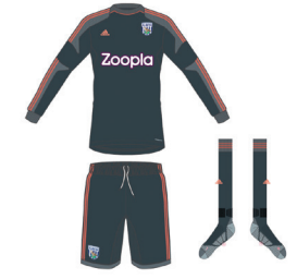
Colours: Shirt: Dark shale, red zest / Shorts: Dark shale (red trim) / Socks: Dark shale (red trim)