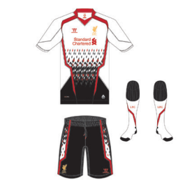
Colours: Shirts: White, Black, Red / Shorts: Black, Red / Socks: White, Black, Red