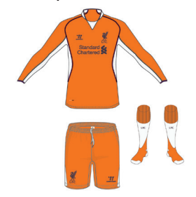
Colours: Shirt: Orange / Shorts: Orange / Socks: Orange