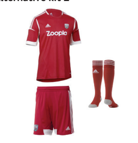
Colours: Shirts: Red (white trim) / Shorts: Red (white trim) / Socks: Red (white trim)