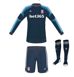
Colours: Shirt: Navy & light blue with white trim / Shorts: Navy with white trim / Socks: Navy with white trim