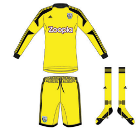
Colours: Shirt: Yellow (black trim) / Shorts: Yellow (black trim) / Socks: Yellow (black trim)