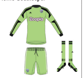
Colours: Shirt: Green with black flashes / Shorts: Green (white trim) / Socks: Green (black trim)