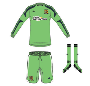
Colours: Shirt: Green with black trim / Shorts: Green with white trim / Socks: Green