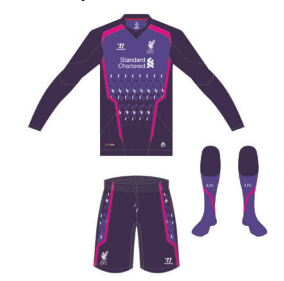
Colours: Shirt: Dark Purple, Purple Pink / Shorts: Dark Purple, Purple Pink / Socks: Dark Purple, Pink