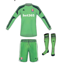
Colours: Shirt: Green with navy trim / Shorts: Green with white trim / Socks: Green with navy trim