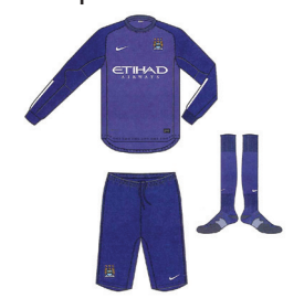
Colours: Shirt: Ultra violet/court purple (two tone) / Shorts: Court purple / Socks: Ultra violet