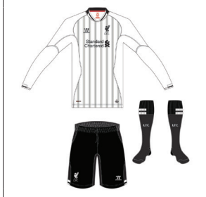
Colours: Shirt: White / Shorts: Black / Socks: Black