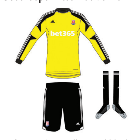
Colours: Shirt: Yellow and black with white trim / Shorts: Black with white trim / Socks: Black with white trim