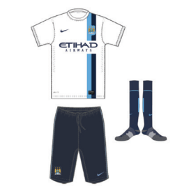
Colours: Shirts: Football white with obsidian and field blue stripe / Shorts: Obsidian (dark blue) / Socks: Obsidian