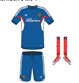
Colours: Shirts: Prime blue, vivid red, white / Shorts: Prime blue, White / Socks: Vivid red, prime blue